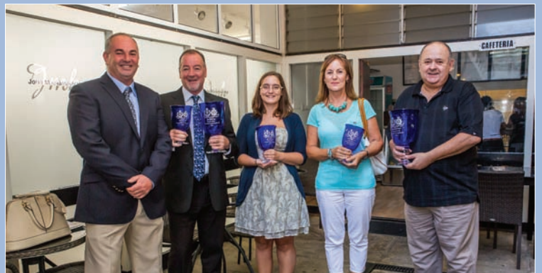
Winners of Photographic and Painting Competition