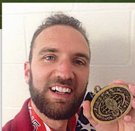
PC 114 TRINIDAD

T he World Police and Fire Games were established in 1985 as a spectacular international sporting event,